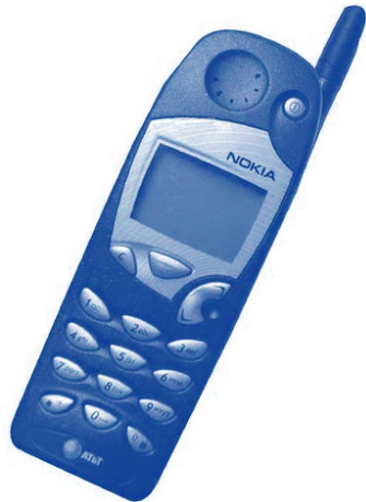
This is the picture caption